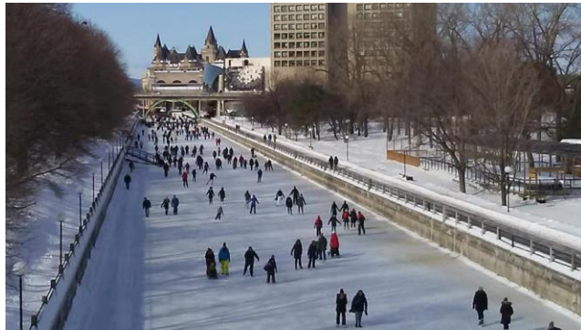
The iconic Rideau Canal looking from the south towards the Parliament Buildings and the Fairmont Chateau Laurier