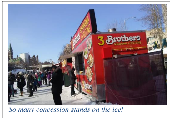
So many concession stands on the ice!

FLAPJACK'S DINER, down in Ottawa's Little Italy Saturday morning. What a wonderful little place! PANCAKES, WAFFLES, LARGE SERVINGS, ENDLESS COFFEE, TEA, OJ, FRIED BACON, FRIED SAUSAGE..NEED I SAY MORE!!! Basically it is FOOD COMA CENTRAL!! A must for anyone visiting, so great for kiddies too!!