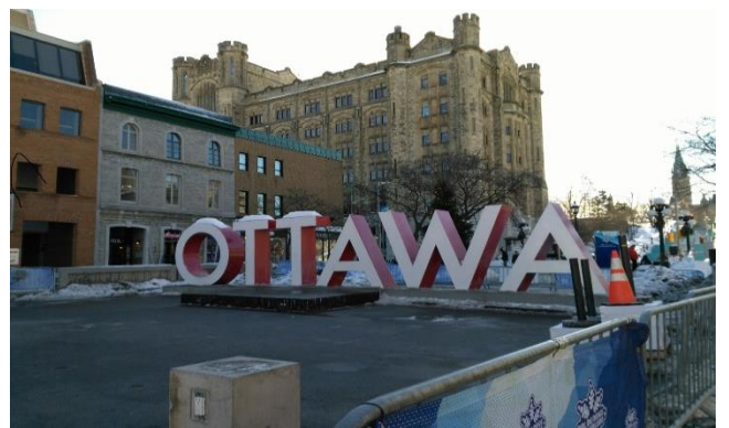
ByWard Market where many of the ice sculpture were located.

Next, By Ward Market, here I come! Ice sculptures..WOW! AMAZING! Examples of very TIME CONSUMING craftsmanship but AMAZINGLY AMAZING! The precision in detail of these sculptures are something to marvel at! Dinner at a pub and as per usual, it never disappoints!! The warmth was a bonus...when temps drop down past -10 degrees.