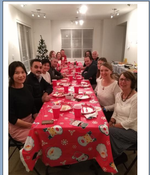
The Christmas merrymakers!