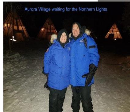
Aurora Village waiting for the Northern Lights