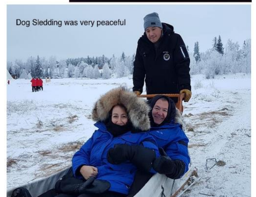
Dog Sledding was very peaceful

Whether you're on your way home or on your way to Canada this Holiday Season, The BCETA wishes you All the Best of the Season!