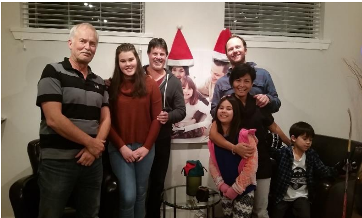
Christmas 2016 – Cardboard family filling in for the family from France who were snowbound in Mission.