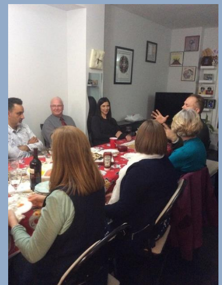
The conversation got louder and livelier as the evening went on. We had so much to share!