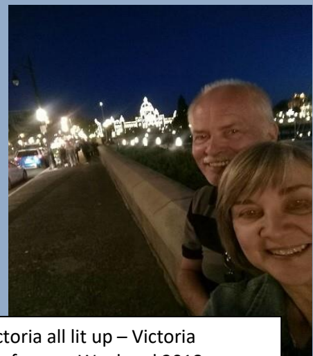
Victoria all lit up – Victoria Conference Weekend 2018