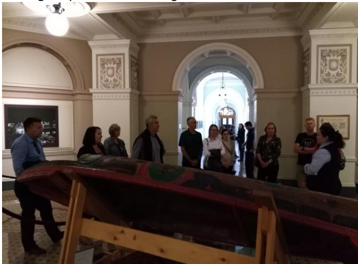
Touring the parliament buildings.