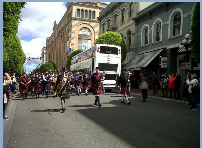
Highland Games Parade – Victoria Conference Weekend