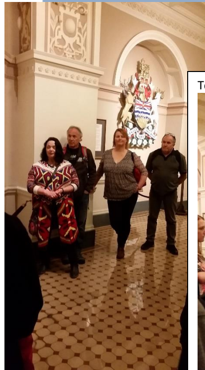
Touring the parliament buildings.