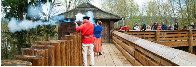
Fort Langley National Historic Site (part of the Circle Farm Tour)