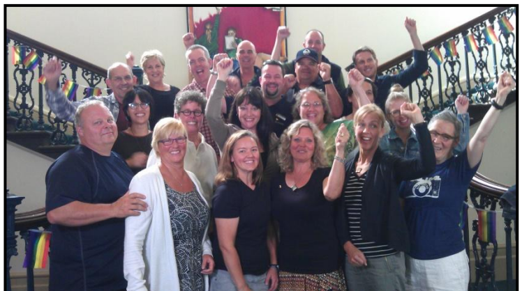
2016 ITF have arrived and looking forward to their year...